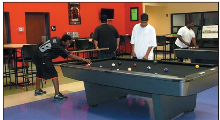
“The Club” at the Boys and Girls Clubs of Hall County new Teen Center offers a variety of activities for area youth.