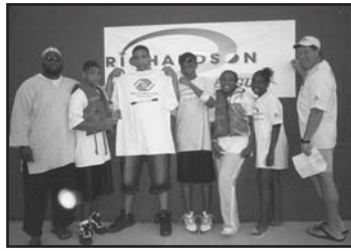
Boys and Girls Clubs of Hall County kayaking team receives awards.

Several participants from the Boys & Girls Clubs team took home gold, silver and bronze