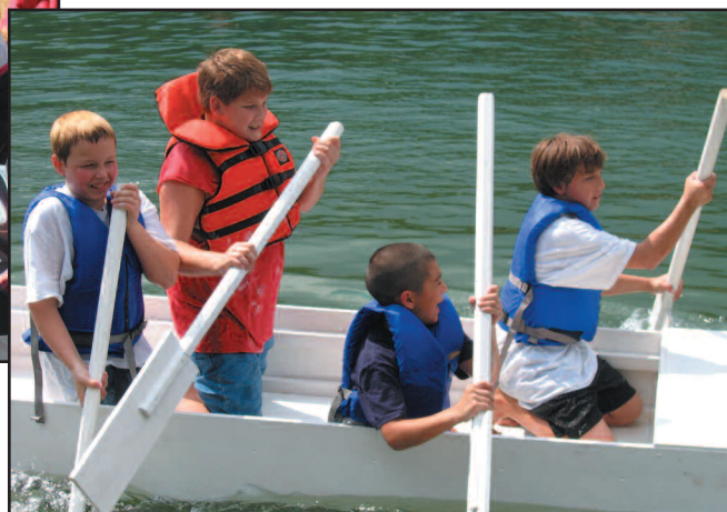
Boys race their boat in the SeaQuest race.

SeaQuest Kids offers youth hands-on classroom experiences, positive reinforcement, and practical problem solving. SeaQuest Kids learn cooperation, team effort, and how to be doers who get the job done. Responsibility, accountability, and honesty to oneself and others are hallmarks of this program.