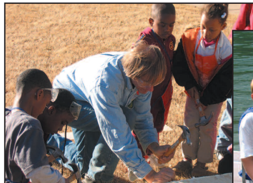
Boys and Girls Clubs members help build their own boat for the SeaQuest race.