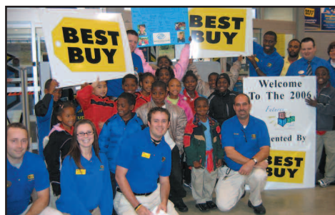
Heartfelt thanks to Best Buy, F4K Gala 2006 presenting sponsor!