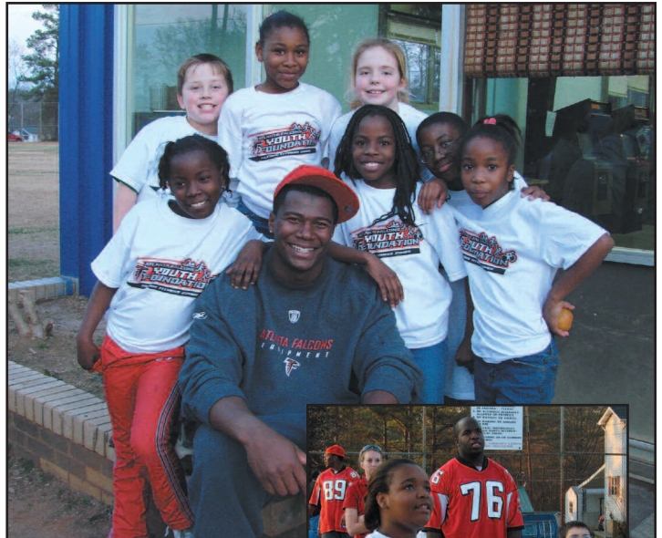
Boys and Girls Clubs of Hall County members enjoy a day of fun and fitness with the Atlanta Falcons.

Our youth are eager and ready to participate in this program because they get to build relationships with the Falcons' players, which are priceless for our kids.