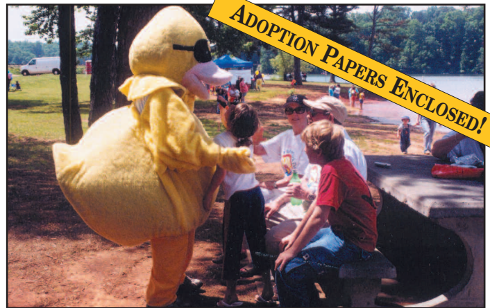
Scenes from last year's Duck Derby.