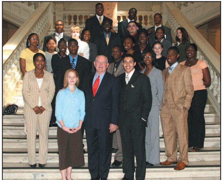
Georgia Youth of the Year participants visit the Capitol.

hands on with my commu- nity, but also effects the