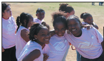
Above: Members participate in GoGirlGo Program at Club

Summer Camp – a great place to meet friends