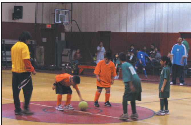
Children playing indoor soccer in the gymnasium.

We are looking forward to seeing everyone again soon for the Summer Soccer Program (registration began mid-March).