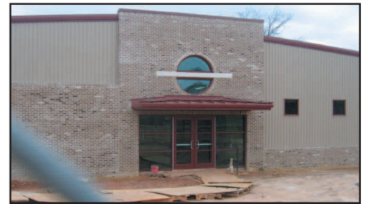
New Teen Center under construction.

of Hall County is truly the positive place for kids.