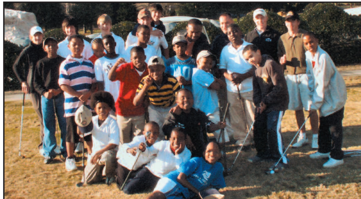
Learning to play golf with some of the North Hall Golf Team and some local pros at the Chattahoochee Golf Course.

While adolescence can be a difficult time for all youth, boys are more likely to commit violent crime, get into trouble in school and join gangs during this critical period in their development. Even in optimal conditions, this time can often be a confusing and perilous one as boys struggle with mixed messages about what it means