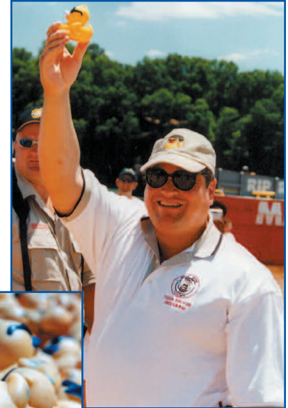
Scenes from past year's Duck Derby.