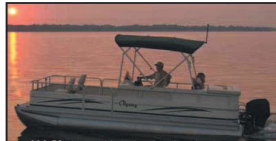
Odyssey pontoon boat donated by Lanier Harbor Marina is this year's grand prize.